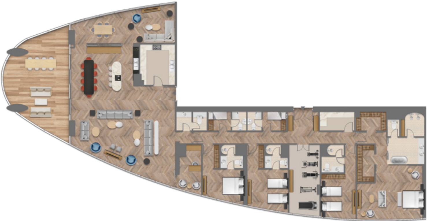
4 BEDROOM APARTMENT, SIMPLEX