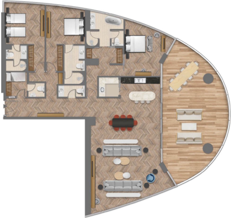
3 BEDROOM APARTMENT, TYPE B