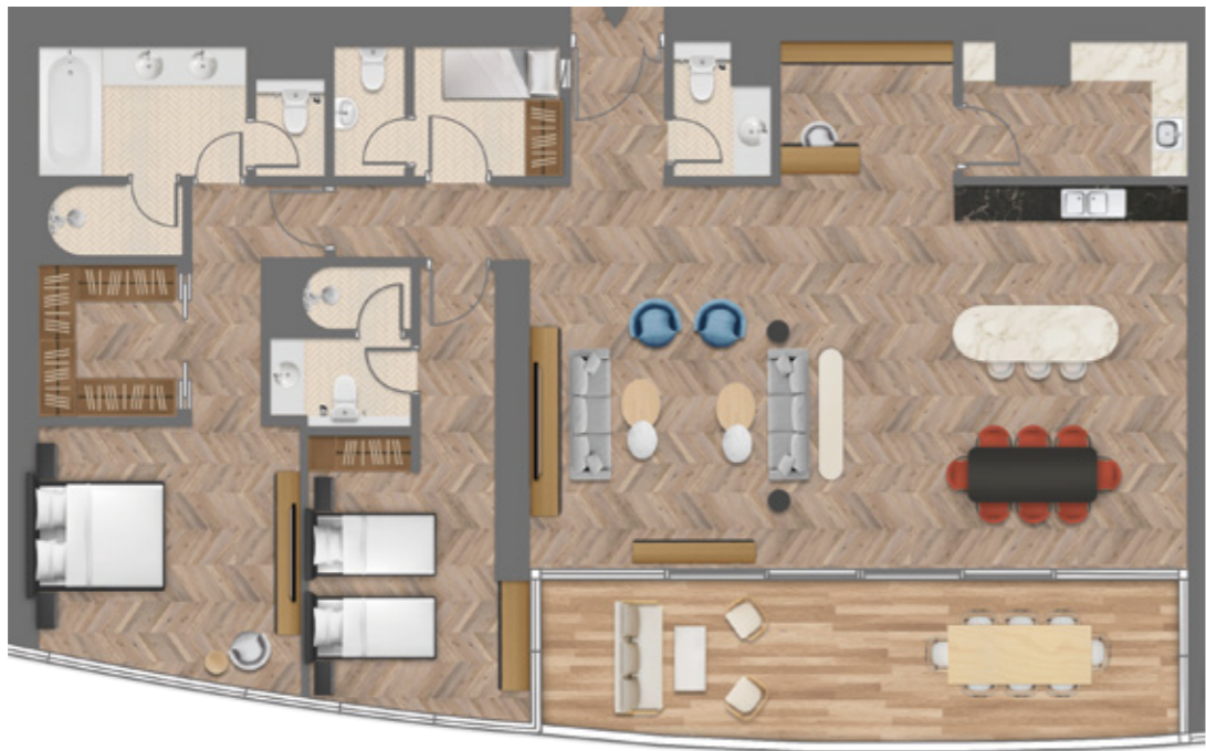
2 BEDROOM APARTMENT, TYPE C