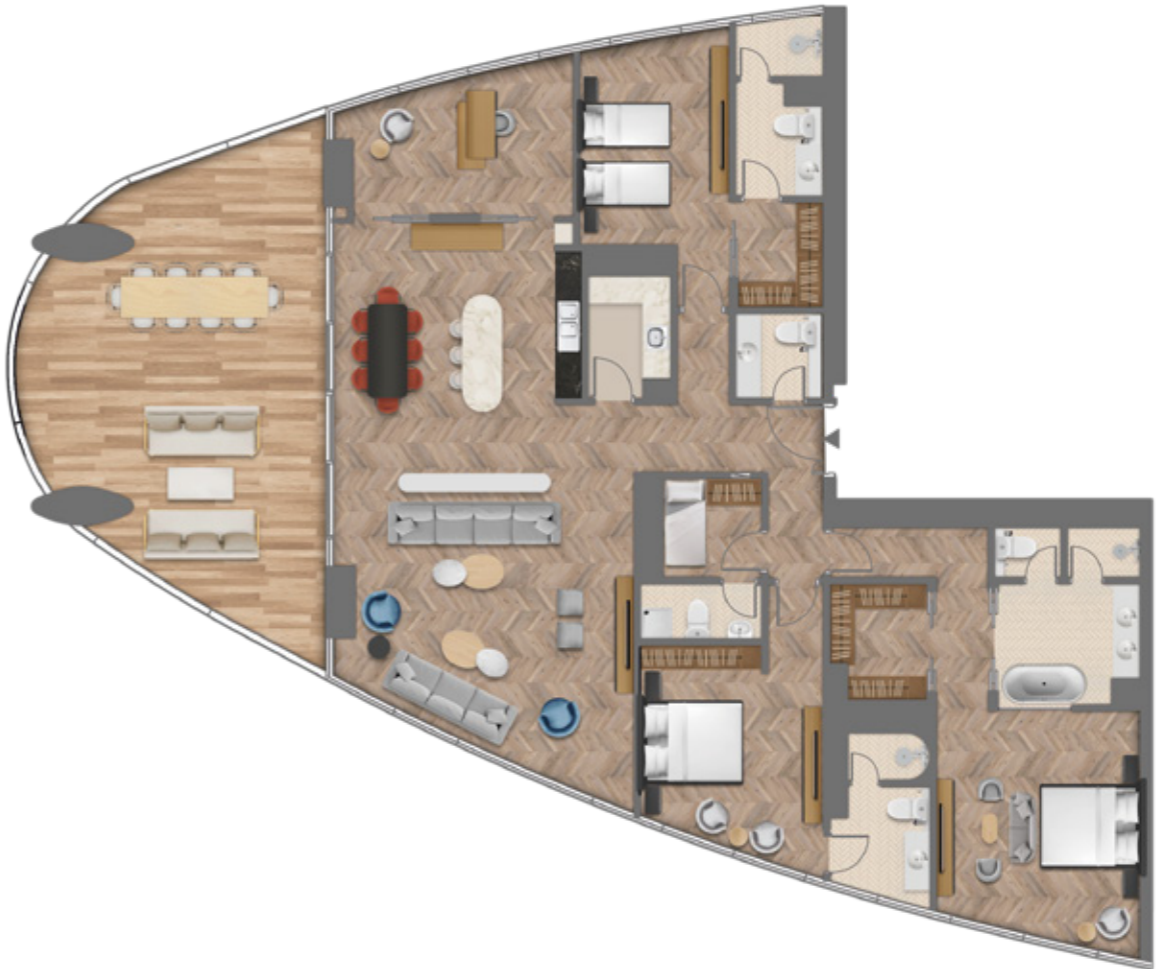
3 BEDROOM APARTMENT, TYPE A