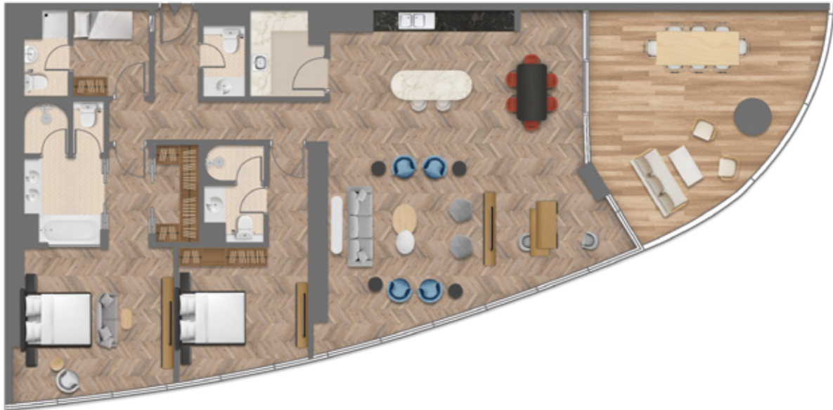
2 BEDROOM APARTMENT, TYPE B