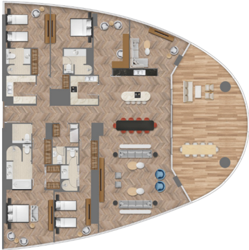
4 BEDROOM APARTMENT, TYPE A