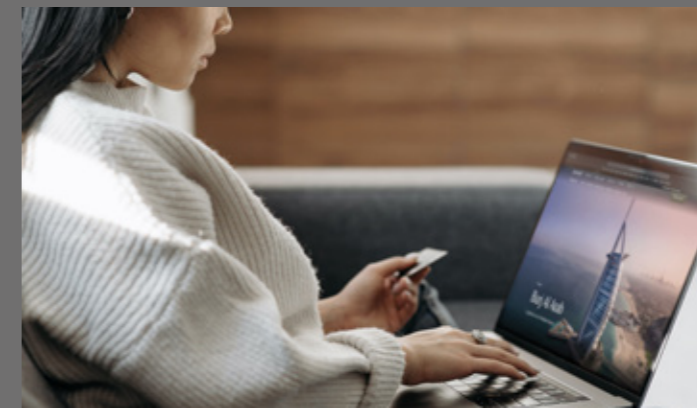
Pay with Points