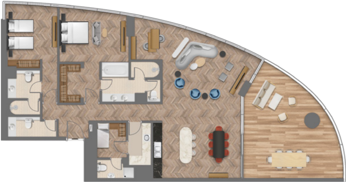
2 BEDROOM APARTMENT, TYPE A